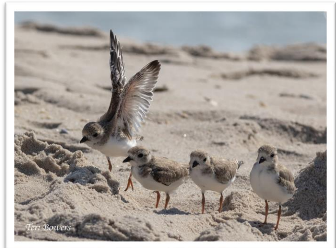
Seaside Park fledglings