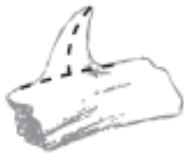
Detail of Point Measurement