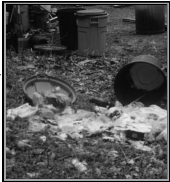
Garbage spilled on the ground after a black bear rummaged through it.

Bears are creatures of habit. They walk the same trails day after day. They eat the same foods from the same places year after year. So if your garbage is available, they'll remember, and they will keep coming back year after year. Is this a problem? DEFINITELY! Have you ever heard the saying "Keep our bears wild -- don't feed the bears"? Bears that eat people's garbage, may become habituated to people. They may lose their fear of humans. They might not run when you try to scare them and they may become mean. Once a bear becomes habituated, it may try and get food from other places. A fed bear may even try to break into someone's house. It might go to dumpsters and garbage cans in the area. Feeding bears creates problem bears for everyone in your neighborhood, not just you. And any bear that breaks into someone's house, or eats a pet will have to be destroyed. That's why people say "Keep our bears wild -- don't feed the bears"!